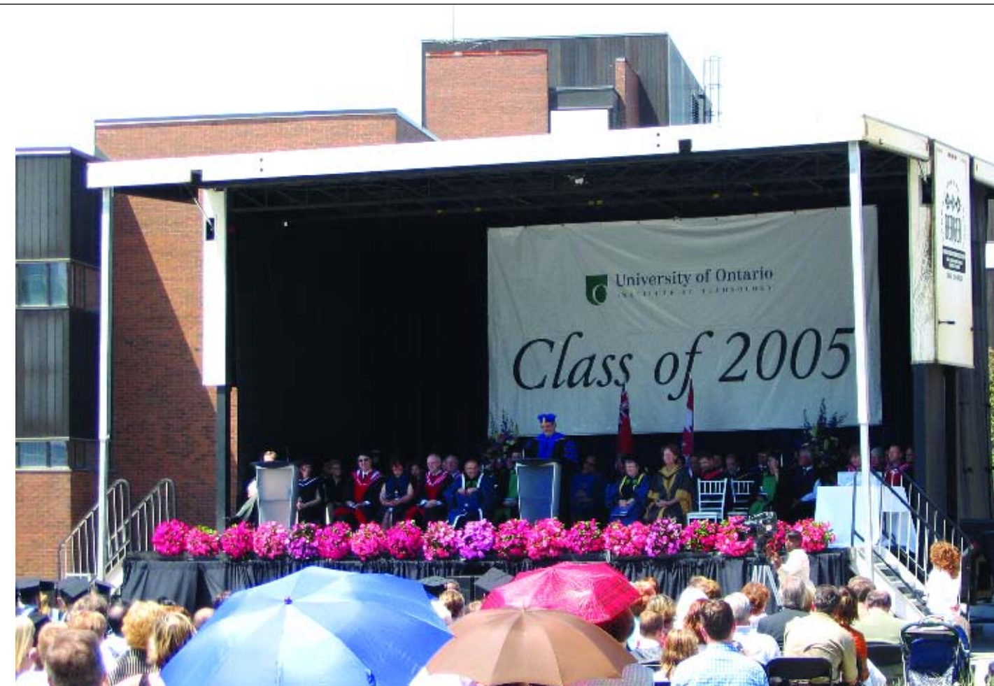
THE 2005 SPRING CONVOCATION FOR UOIT, WHICH WAS HELD OUTDOORS. DURHAM GRADS WILL ALSO BE RECEIVING THEIR DIPLOMAS AT AN OUTDOOR CEREMONY ON CAMPUS IN JUNE.