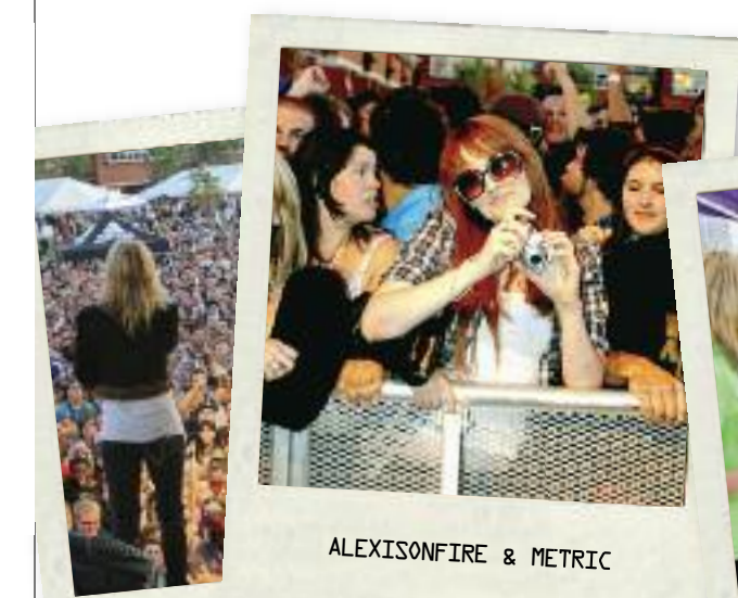
ALEXISONFIRE & METRIC