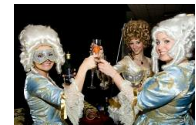
LAST BLAST MIDNIGHT MASQUERADE

There are numerous ways to get involved on campus and make new friends and you won't find a more perfect location to unwind with new classmates than E.P. Taylor's Pub and Restaurant, one of the top campus pubs in Ontario. In addition to drinks and great food, E.P. Taylor's offers concerts, Campus Idol, lunch and evening comedy shows, karaoke, battle of the bands and more.