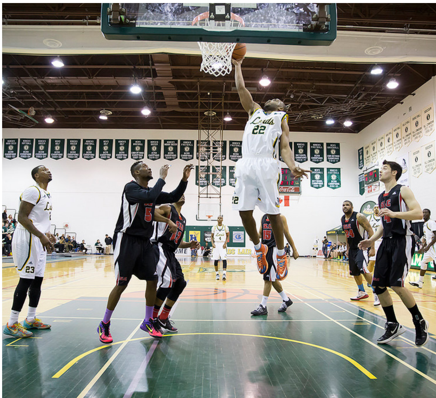
The Durham College Lords ruled at the 2015 OCAA men's basketball championship and took home the gold.