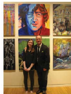
Student Exhibitions and AGO Field Trip.