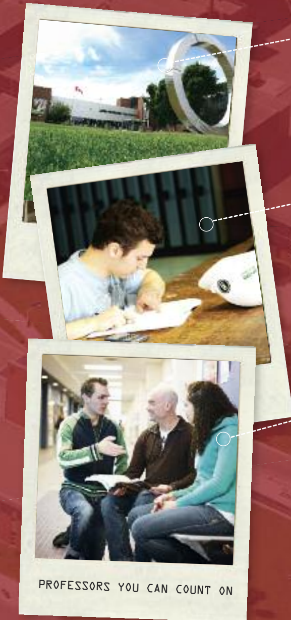
PROFESSORS YOU CAN COUNT ON

"I decided to attend Durham due to the great reputation of its Human Resources Management graduate certificate program. I already have my degree and needed a direction as to where to take the next step in life. I find it's very personalized, there's always information being sent out to me and my instructors know me even though they may teach three or four other courses. I would tell new students to not be afraid to explore. It's a large campus and there are tons of opportunities."