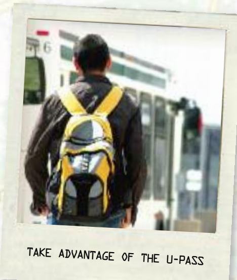
TAKE ADVANTAGE OF THE U-PASS