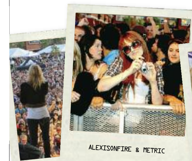
ALEXISONFIRE & METRIC