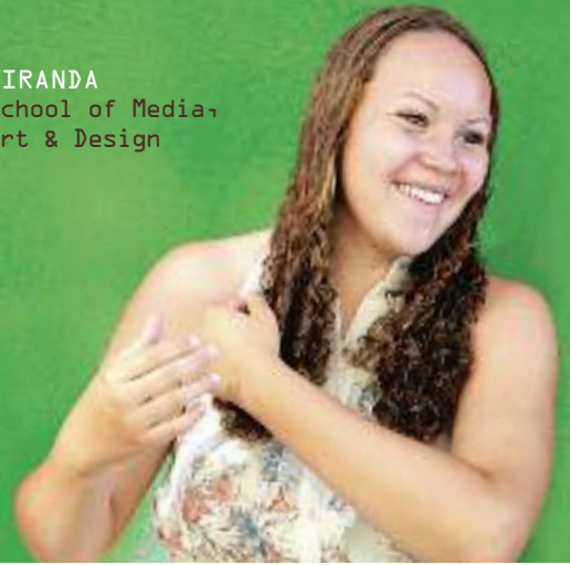
MIRANDA School of Media, Art & Design

Durham College instructors prepare students for future careers in all sectors of the field, in a fast-paced yet comfortable working environment. They provide the appropriate foundations that students need to be successful. "