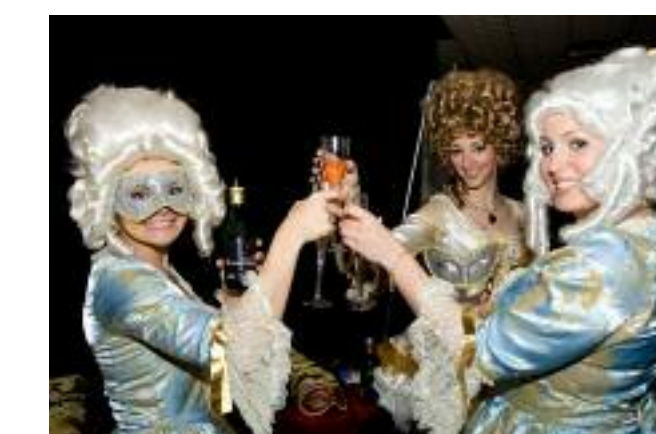
LAST BLAST MIDNIGHT MASQUERADE

There are numerous ways to get involved on campus and make new friends and you won't find a more perfect location to unwind with new classmates than E.P. Taylor's Pub and Restaurant, one of the top campus pubs in Ontario. In addition to drinks and great food, E.P. Taylor's offers concerts, Campus Idol, lunch and evening comedy shows, karaoke, battle of the bands and more.