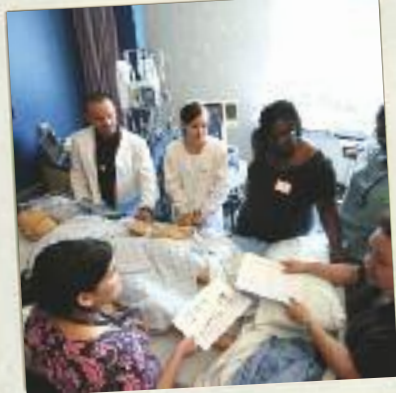
STATE-OF-THE-ART BIOTECHNOLOGY AND NURSING LABS