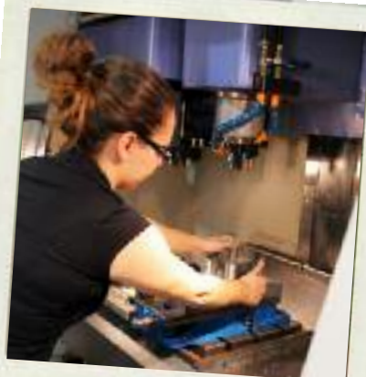
HIGH DEMAND SKILLED TRADES PROGRAMS FOR THE FUTURE